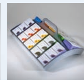
Table Caddy IN 60-5000 10.25W x 9 x 5H"