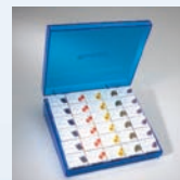
Blue Display Box IN DISPBOX 10.25W x 9.75D x 3H"