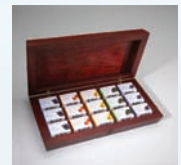
Small Wood Display Box IN 60-0305 11.75W x 5.5D x 2H"