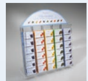
Clear Dispenser Display IN 60-0303 10.75W x 10D x 12.75H"