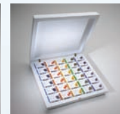
White Wood Display Box IN 60-0307 11.75W x 11D x 2H"